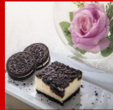
French Cheese Cake & Assorted Traditional cakes