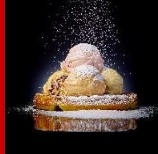
Italian Alfero Gelato Bar