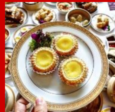
Complimentary Dim Sum Buffet for Couples